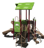
A rendering of the new playground equipment coming to St. Helena's School.