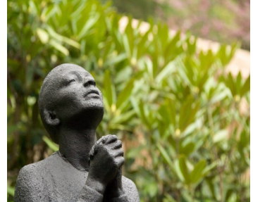
Richmond Barthe', 1940

If you are a woman desiring a safe place in a busy world where you can join with other women of St. Helena's to support each other in Christ's love, then please consider joining the Daughters of the King. We make a promise at our confirmation to pray, work, and give to expand Christ's Kingdom.